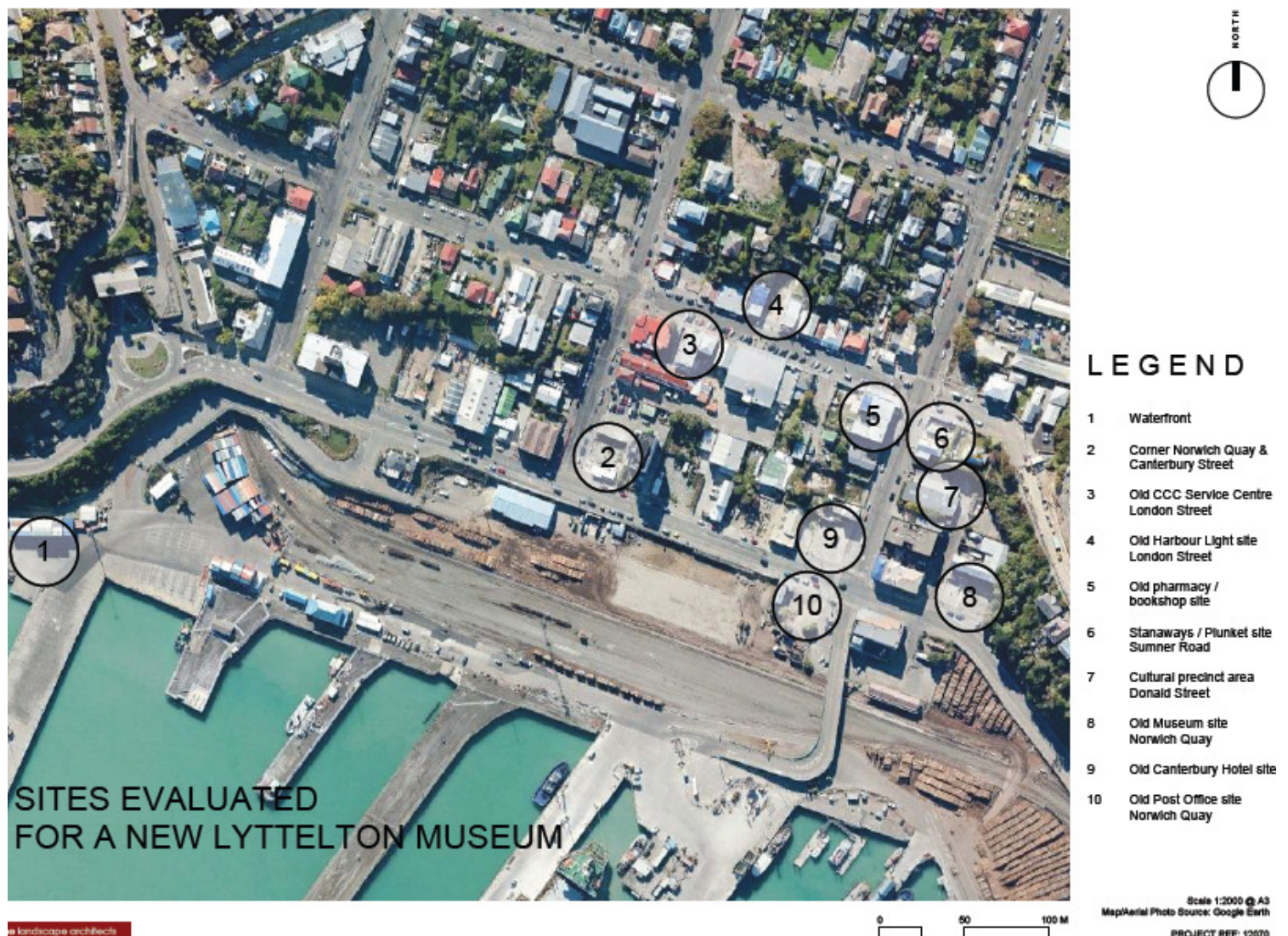
Plan showing the sites evaluated for a new Museum building.