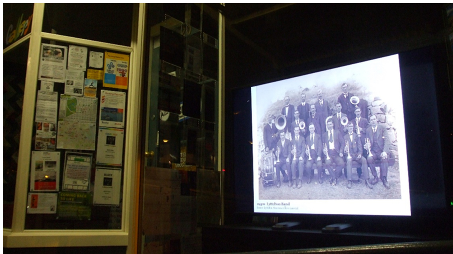
Lyttelton Museum slideshow in the window of the Lyttelton Information Centre – the display runs 10am – 9pm each day.

This new display is another positive step in the museum's journey to re-establish itself in Lyttelton. The funding for this project came from our Distributed Displays grant made by the Christchurch City Council and supported by the Lyttelton/Mt Herbert Community Board.