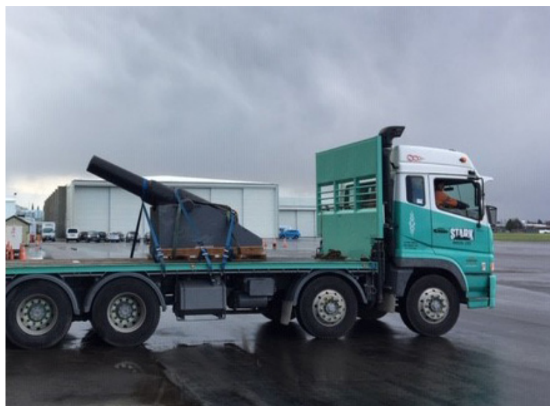
The cannon on Starks' truck