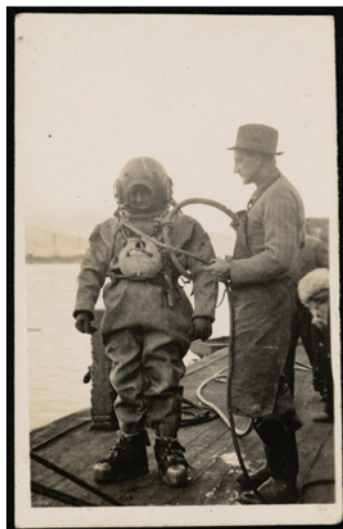
A Lyttelton Harbour Board diver in a Siebe Gorman diving suit similar to one in our collection, ca. 1950.

Hard to choose...but they are the diorama model of Lyttelton that used to sit downstairs at the old Museum and the Diver in traditional hardsuit & helmet, this was also in the old museum on the staircase and it reminds me of a relation of mine who was a diver for the British Navy and wore the very same suit.